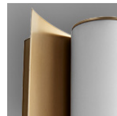
-40 Aged Brass